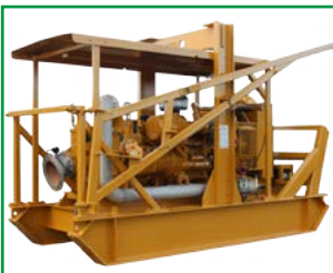
SELF PRIMING PUMPS