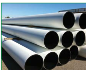
PIPE & HOSE