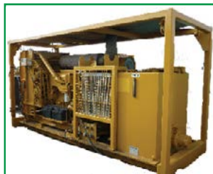
HYDRAULIC POWER UNITS