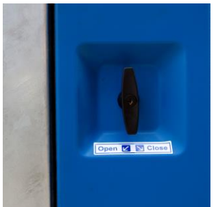
Safety Extremely durable and lockable T-locks offering perfect grip.