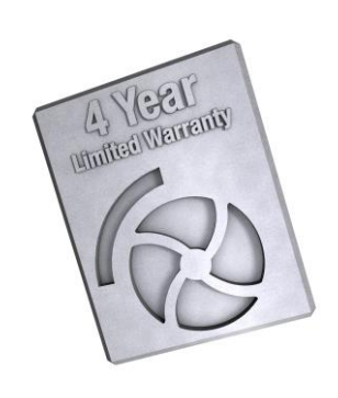
4 Year limited warranty The BBA limited warranty covers years or operating hours whichever occurs first. For more details please consult the BBA warranty book.

Pump specifications are subject to change without prior notice to improve reliability or design.