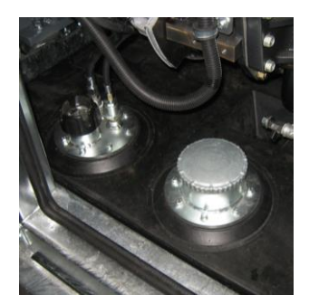
Fuel tank Fully bunded, corrosion-free, 300 liter, high-density polyethylene (HDPE) fuel tank, located in base of canopy.