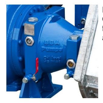
Easy inspection Oil glasses, drain valves and fill plugs are all easily accessible.