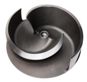
Semi-open impeller Corrosion and abrasion resistant pump impeller made of chrome moly (42CrM04) alloy.