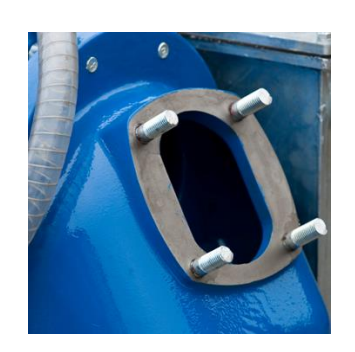
Large inspection covers Easy access to float box, impeller and non-return valve.