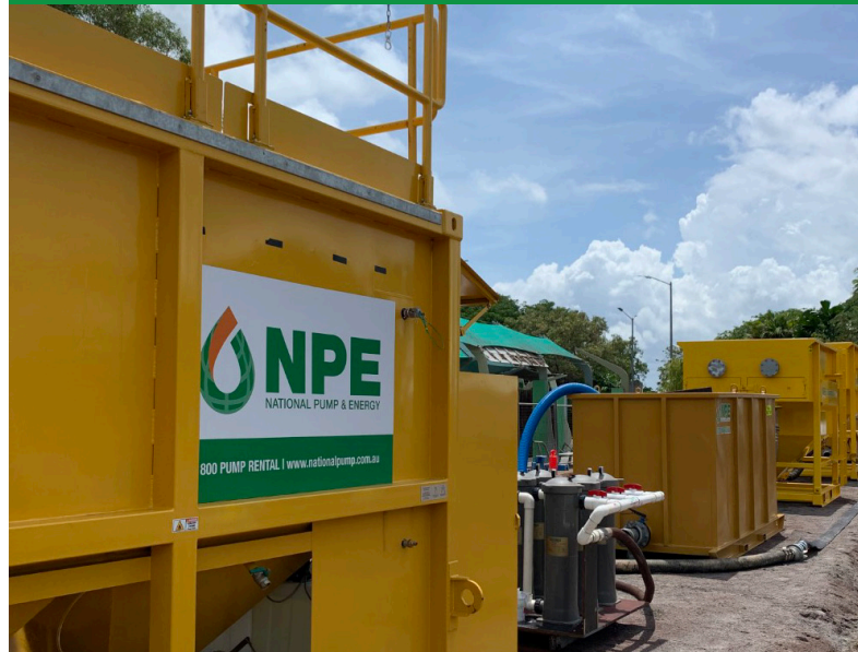
State Square Precinct