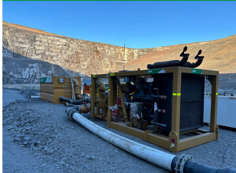
McArthur River Mine