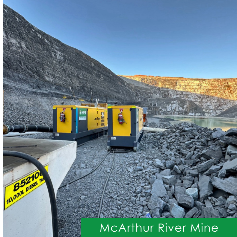
McArthur River Mine

NPE adheres to the highest standards of Quality, Health, Safety, and Environmental Management for our projects and operations.